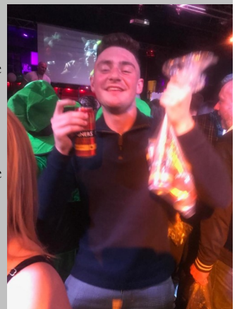
Rhino: A "can-do" attitude

"Total respect to him. The guy wasn't even bothering to open the cans. Now that's bloody impressive."