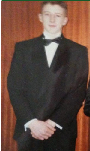
Donaghy's audition picture

The popular Tyrone man exclusively revealed to The Echo how he failed in a final audition to play James Bond, just before Pierce Brosnan was handed the role.