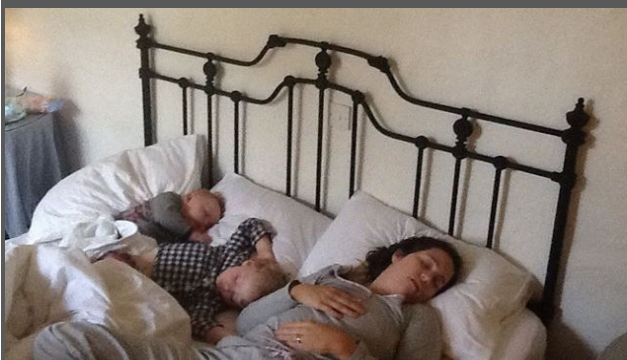
No room at the inn for the charity king