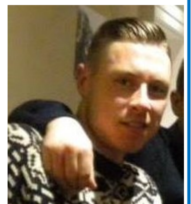
Killeen: wedding planner