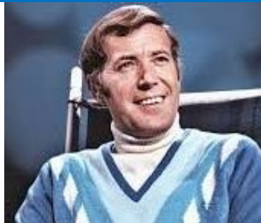
Hero: the late Val Doonican